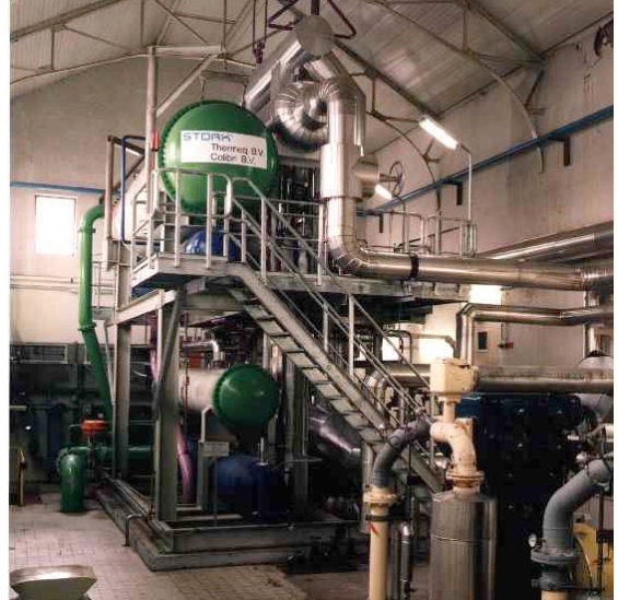
Figure 5 - ARP in combination with CRP for peak load

In figure 5 is a picture of such a combination with one of the old compressors in the front. In this margarine factory the old compressors remained to cover the peak loads of refrigeration.