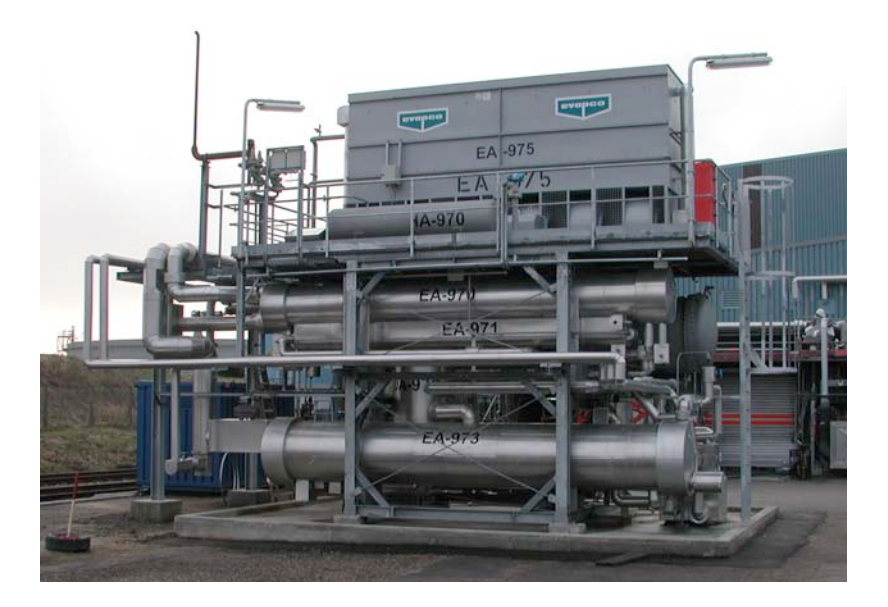
Figure.1- A typical AARP for 550 kW in a chemical industry

With the exception of the pump and the control valves all other components are heat exchangers, valves, piping and instrumentation which do not need much maintenance or repair works, because there is no mechanical wear. Figure 1 shows the picture of an AARP in the chemical industry.